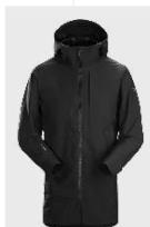
ARCTERYX SAWYER COAT