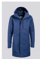
ALPHA TAURI KOOV PARKA