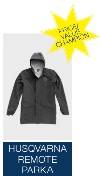
HUSQVARNA REMOTE PARKA