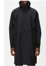
PEAK PERF. GORE-TEX PARKA