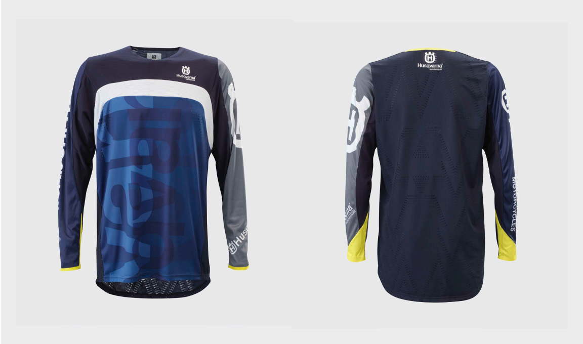
3HS21003200X / Railed Shirt Blue

The lightweight Railed Shirt gives riders an optimized combination of ventilation, performance, and comfort. Constructed from highly ventilated mesh fabrics, it is breathable and comfortable, while the athletic, tailored cut aids freedom of movement.