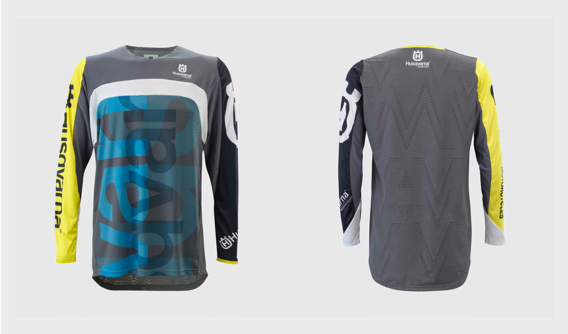
3HS21003190X / Railed Shirt Turquoise