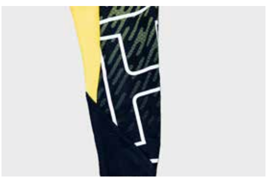
UV-RESISTANT AND FADE PROOF SUBLIMATION PRINTS