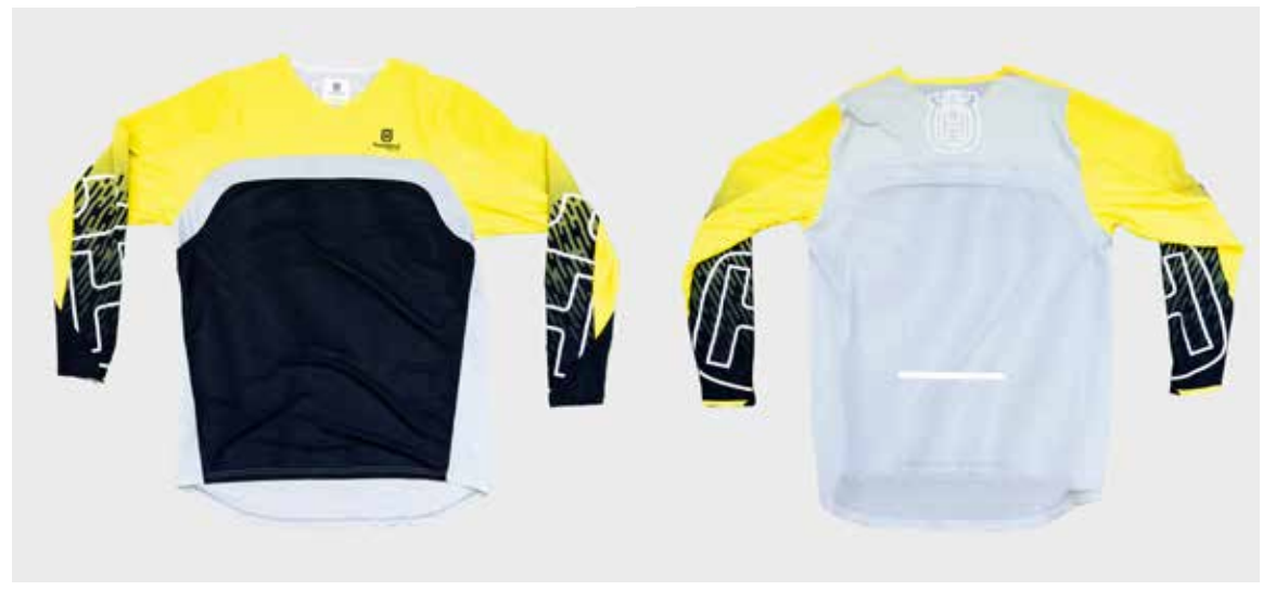
3HS21000350X / RAILED SHIRT PRO

The ultra-lightweight RAILED SHIRT PRO gives riders an optimized combination of ventilation, performance, and comfort. Constructed from highly ventilated mesh fabrics, it is breathable and comfortable, while the athletic, tailored cut aids freedom of movement. Contrasting corporate colors complete the look.