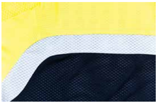
MESH PANELS FOR OPTIMUM VENTILATION MAXIMUN AIRFLOW

HIGH VENTILATION TEMPERATURE REGULATION THROUGH MESH PANELS