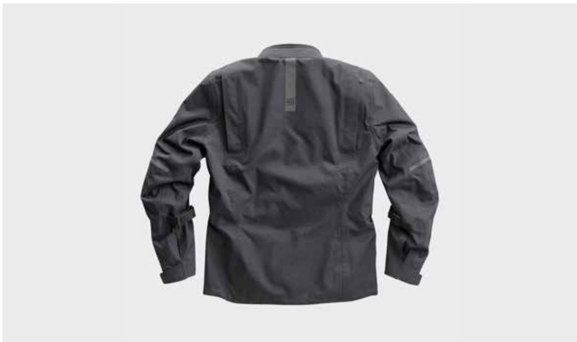
3HS20003070X / PURSUIT GTX JACKET