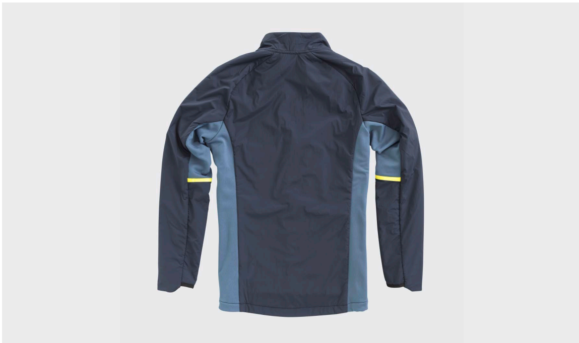
3HS21001270X / Remote Hybrid Fleece