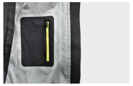
Concealed pockets and inner pocket with zipper Protect important things from water