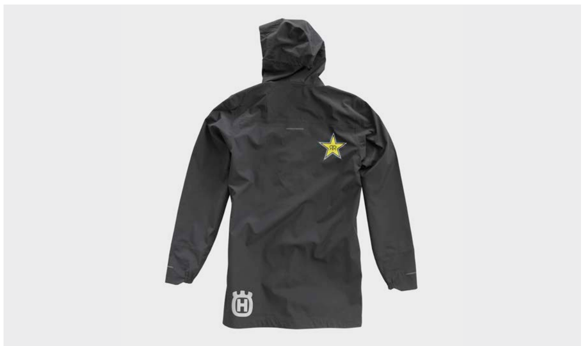
3RS21001330X / RS Remote Parka