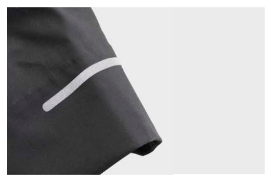
Reflective details For good visibility even in bad weather and darkness