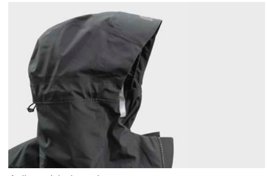
Adjustable hood Adapted to your head it doesn't obstruct the view