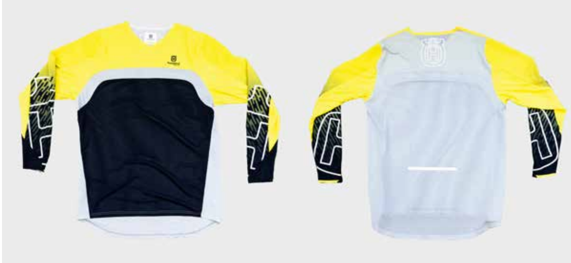
3HS21000350X / RAILED SHIRT PRO

The ultra-lightweight RAILED SHIRT PRO gives riders an optimized combination of ventilation, performance, and comfort. Constructed from highly ventilated mesh fabrics, it is breathable and comfortable, while the athletic, tailored cut aids freedom of movement. Contrasting corporate colors complete the look.